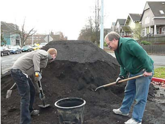
South Yakima and 6 th Ave planting project 2008