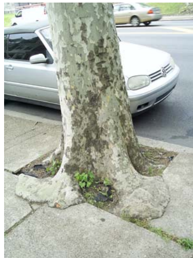
A tree that has overgrown the rooting space it was given.

Review landscape plans to ensure compliance with applicable regulations, and standards and guidelines set forth in the UFMP and Urban Forest Manual.