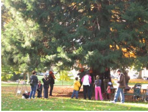
Fall Tree Festival October 2008- An outreach special event encouraging families to be active in their urban forest.