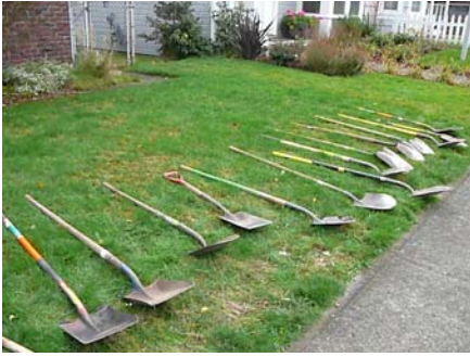
Shovels ready to plant trees.