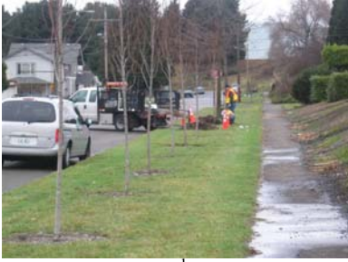
New trees at S 23 rd and S Alaska St