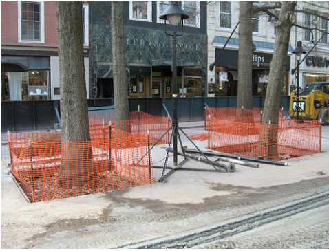
Fencing used around trees to help protect them through construction.