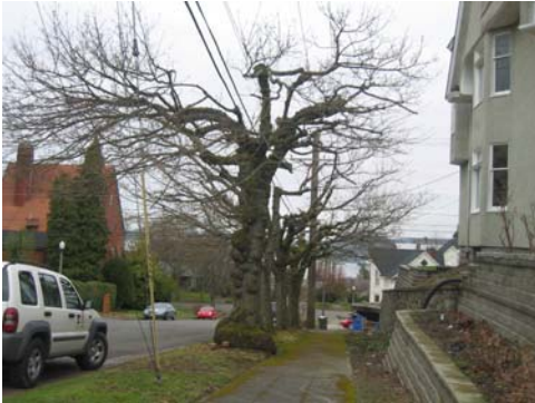
Inappropriate trees under power lines

Implement a voluntary removal/replacement program of inappropriately located trees within the rights-of-way, such as under overhead utility lines, to reduce tree/infrastructure conflicts.