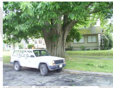
Historic tree in North Tacoma

Partner with federal, state, regional and local governmental jurisdictions, community non-profits, and the private sector to increase sound preservation of our urban forest.