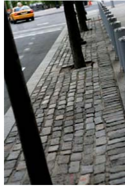
A continuous trench used with pavers.

Increase the dedicated airspace and dedicated root volume available for street tree planting to provide better accommodation of large canopy street trees and assist with achieving the optimum canopy coverage goal.