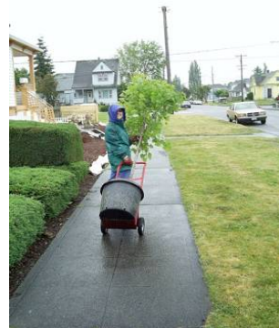
A property owner is moving a tree during a neighborhood group planting.

Refrain from removing non-native plants within park and open space areas solely because they are non-natives. Plant removal should be related to other valid management policies, including habitat restoration.