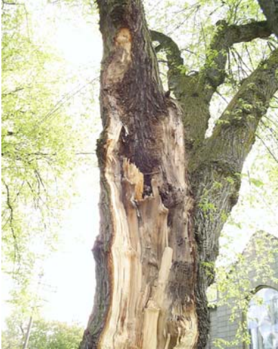
A severely damaged tree before removal