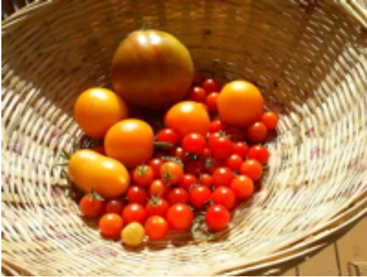
Fresh locally grown tomatoes

care of plants in a manner that does not threaten the health of the urban forest ecosystem.