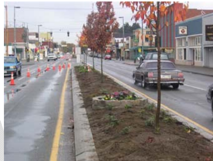
South Tacoma Way

Medians that are planted within the City on public streets, unless otherwise designated, shall be the responsibility of the City of Tacoma to maintain. Medians may be used for natural drainage systems to manage stormwater or landscaping. Medians may not be used as community gardens due to safety concerns.